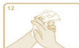
Dry hand with a single-use towel