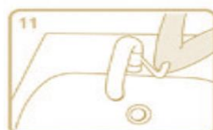
Use elbow to turn off tap (if possible)