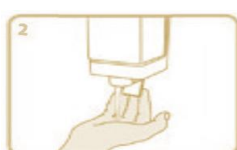
Apply about 2 ml to 5ml of soap to cover all hand surfaces