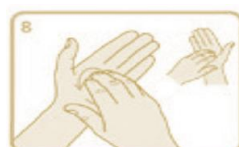
Rub tips of fingers in opposite palm in a circular motion