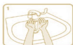
Wet hands with water