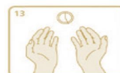
Hand washing should take 20 - 30 seconds