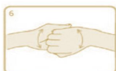
Rub with back of fingers to opposing palms with fingers interlocked