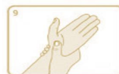
Rub each wrist with opposite hand