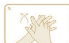
Rub palm to palm with fingers interlaced